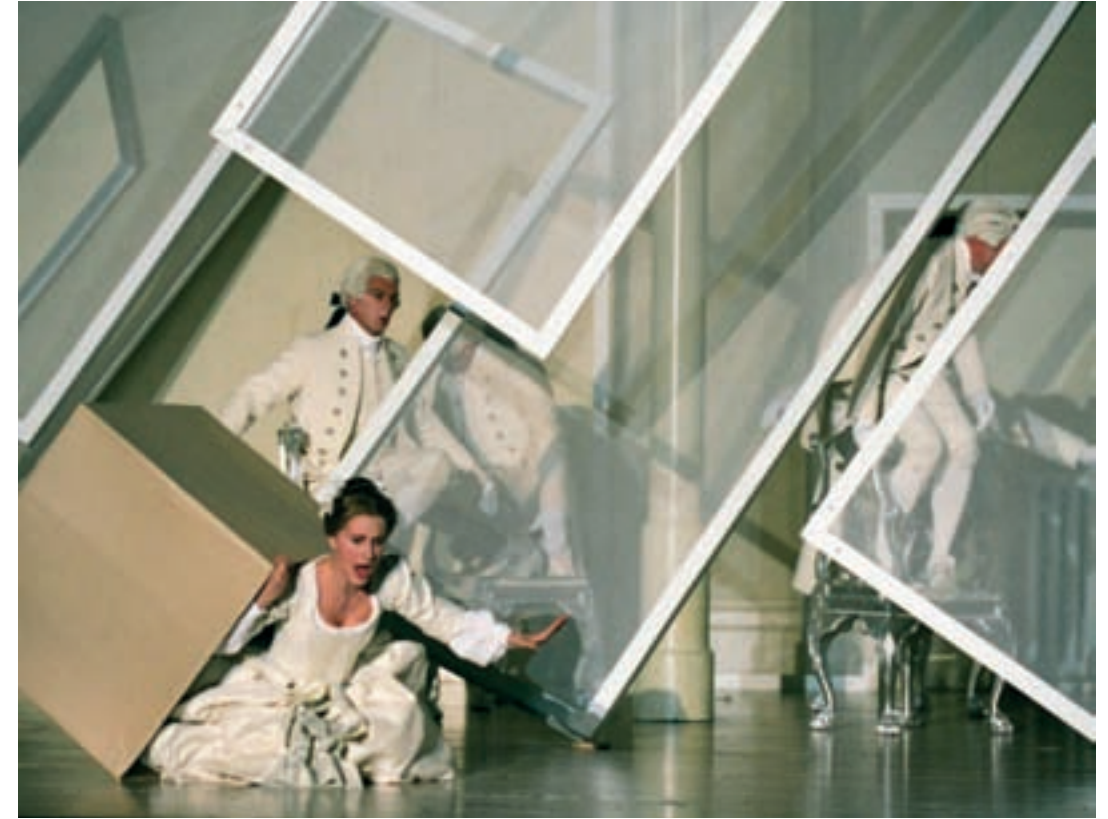
Glyndebourne on Tour, Le Nozze di Figaro 15 & 17 November 2005

An example of one of approximately 15 Arts Council England subsidised productions that perform at Milton Keynes Theatre each year. Others include Glyndebourne Touring, Welsh National Opera and the National Theatre.