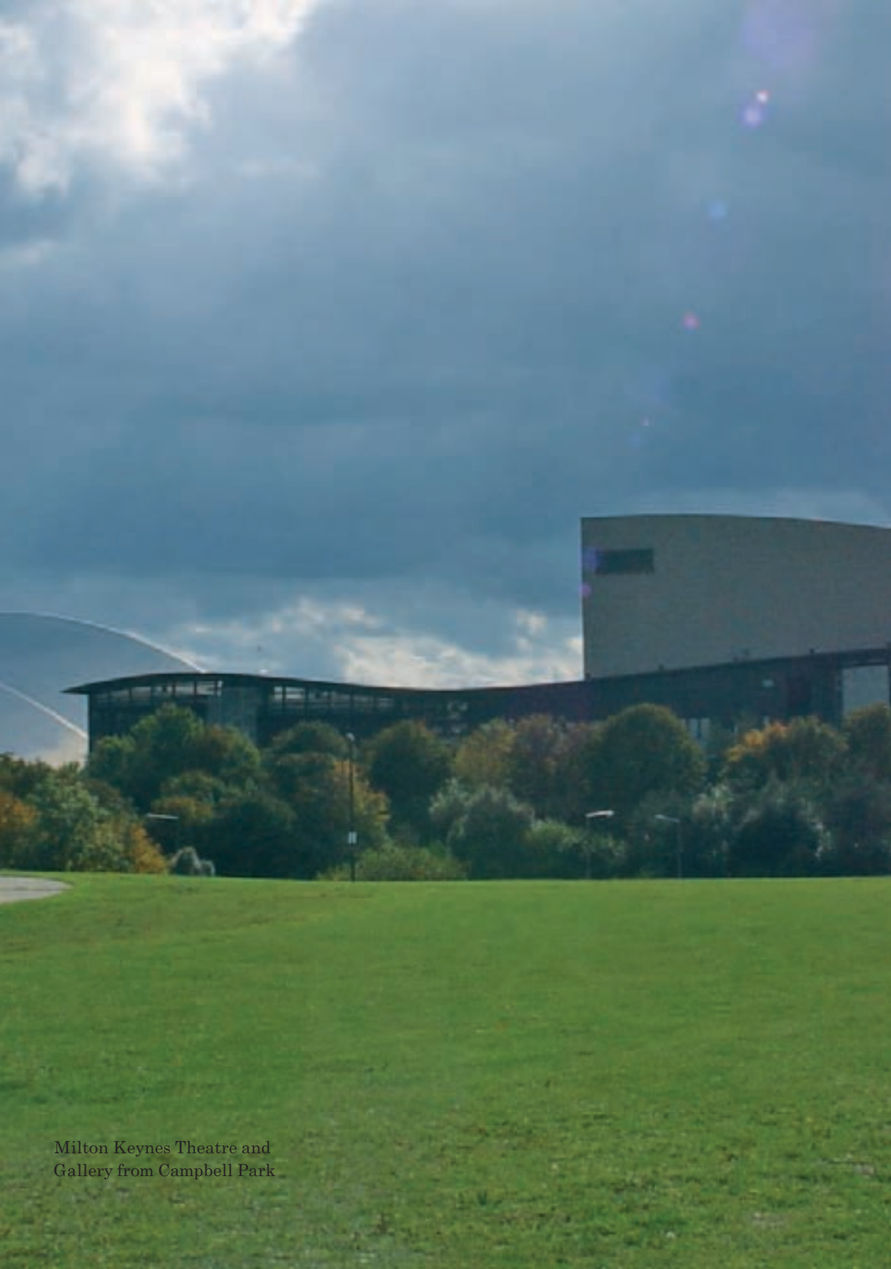
Milton Keynes Theatre and Gallery from Campbell Park