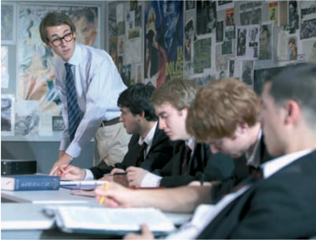
The National Theatre's production of Alan Bennett's The History Boys 22 – 26 November 2005

“With its enthusiastic audiences, beautiful building and supportive staff, Milton Keynes Theatre is a favourite stop on the touring roster for the National Theatre and we look forward to returning again.”