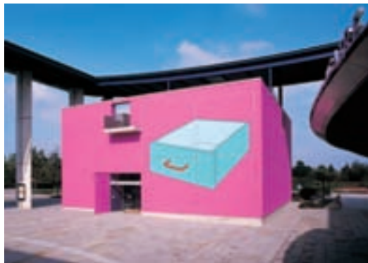
Michael Craig-Martin: Exterior façade commission Milton Keynes Gallery, 2004