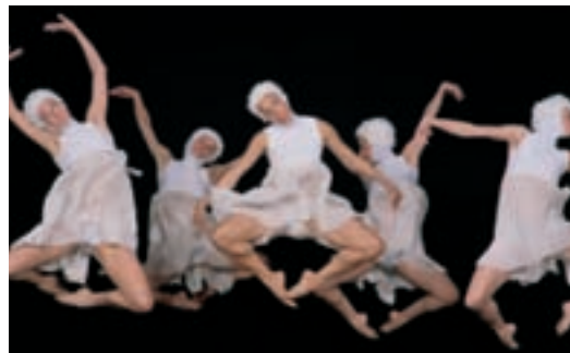
Rambert Dance, Constant Speed 2 – 5 November 2005

Nicholas Hytner, Artistic Director, National Theatre