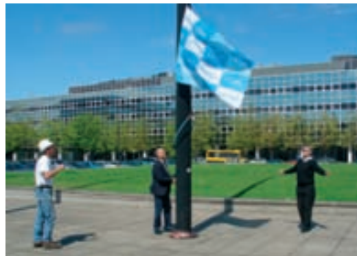
Langlands and Bell: Who's Afraid of Red, Black and Blue? Installation of eight flags, Station Square, Milton Keynes, 2005